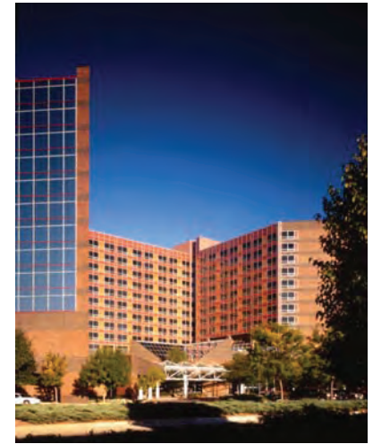
Sheraton Indianapolis Hotel & Suites

8787 Keystone Crossing Indianapolis, Indiana 46240 Reservations: 1-800-687-7733 www.starwoodhotels.com