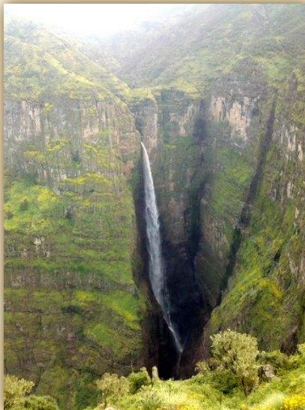
Photo 2: Gibar Waterfall, 500m high over basalt fault scarp, second highest waterfall in Africa, top elevation approx 3600m, Simien Mountains National Park