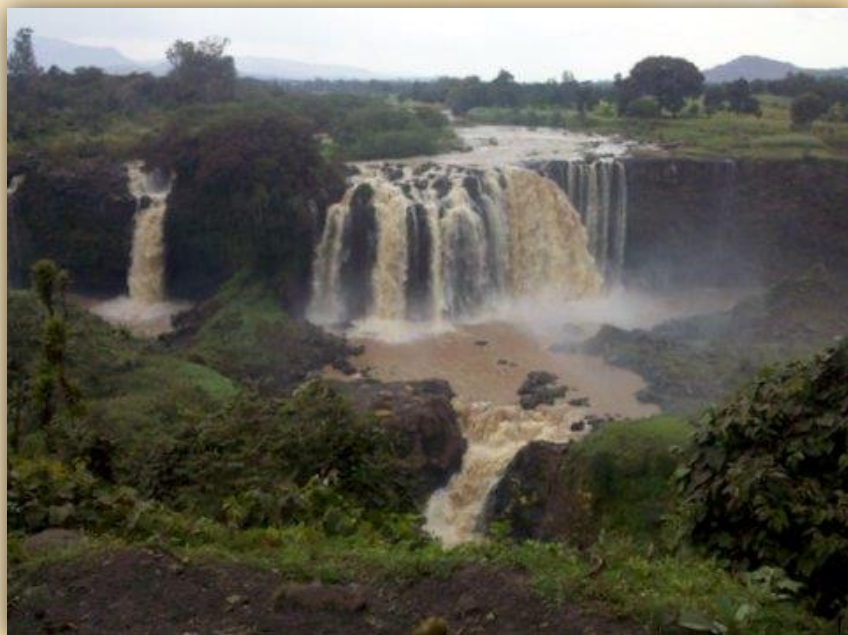
Photo 3: Blue Nile Falls, 32km southeast of river's source at Lake Tana (near Bahir Dar), height 40-45m, overflow length approx 250m here (up to 400m in rainy season), flow diminished by nearby hydropower plant