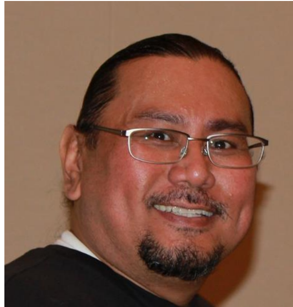
AIM Chair- Elect