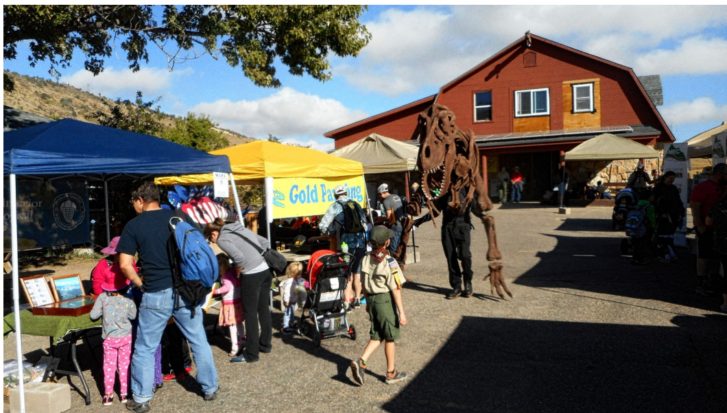
(Boy Scout Day 2019)

American Institute of Professional Geologists—Colorado Section Colorado Section email: Colorado-aipg@outlook.com