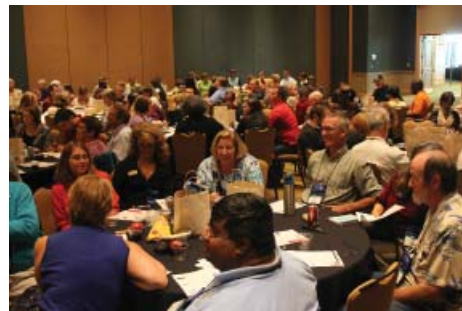
Regional Meeting and lunch