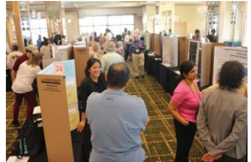
Attendees browsing the posters

On Friday afternoon at the recent AMATYC Annual Conference, as the Regional Meetings ended, attendees headed to fill their minds with innovative and practical ideas for use