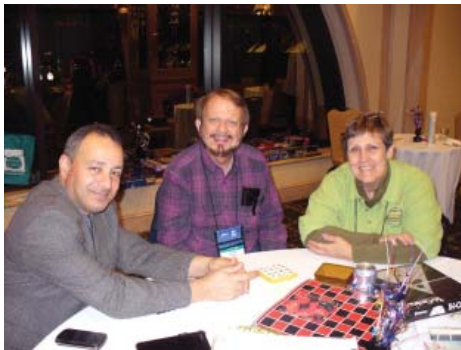
Attendees enjoying game night

Wednesday evening, prior to the official beginning of the conference, the local events committee hosted a game night for those who arrived early. Old friends became reacquainted, new friends