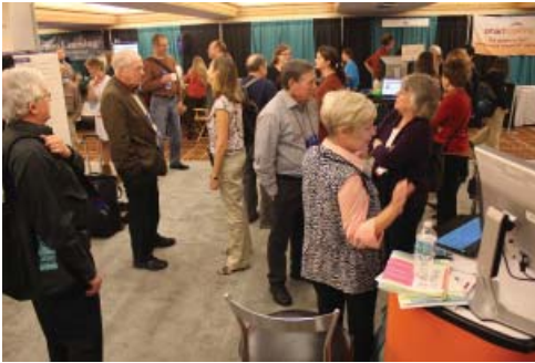
Attendees visiting with an exhibitor

The Exhibit Hall at the AMATYC Annual Conference in Jacksonville was full of exhibitors and activities. The entire hall of seventy booths was utilized by forty-two exhibitors. Many exhibitors