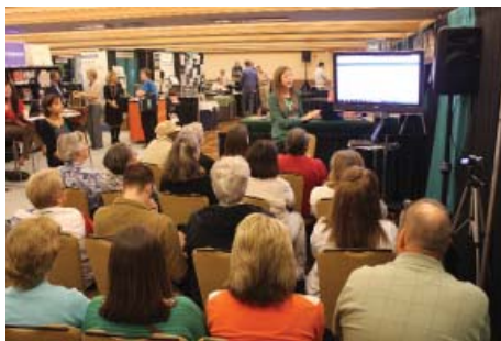
Attendees watching a product presentation

Each year, some exhibitors present their product and services in the form of a commercial presentation or product presentation. At last year's conference, commercial presentations lasted ninety minutes while product presentations ran for thirty minutes. These presentations were excellent ways to further learn about the exhibitors' products and services.