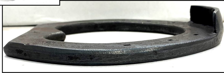
Left Front Sidebone