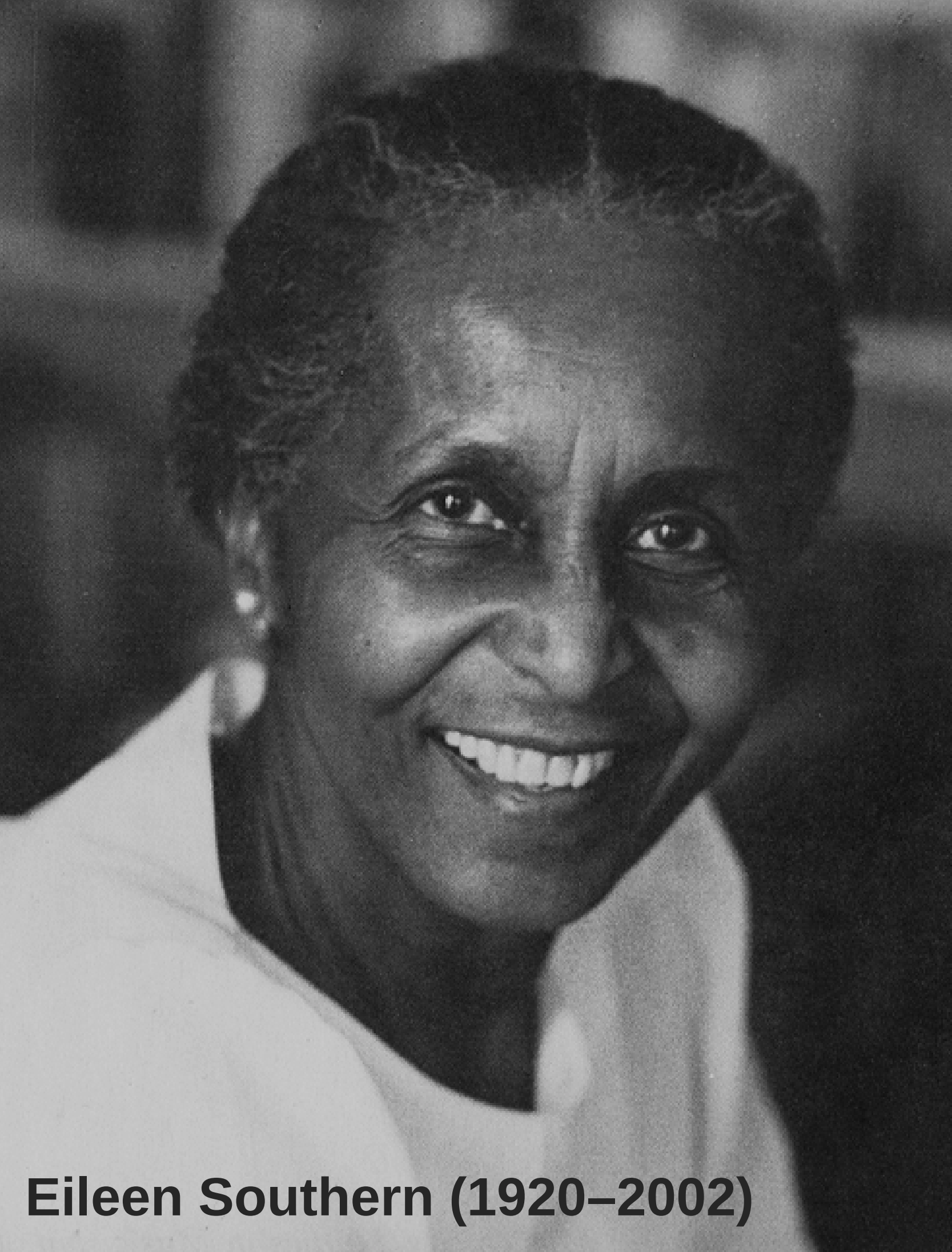
Eileen Southern (1920–2002)