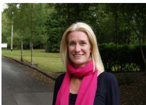
Amanda Milling (Member of Parliament)

19:30 pm - Welcome reception Gala Dinner