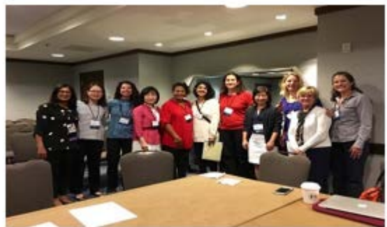
2016 Women in Radiology Breakfast

The course consisted of oral presentations from 87 faculty members, 71 of whom are ASER members. Scientific paper and poster presentations and educational poster presentations were higher in caliber and number than ever. In total, there were 18 papers, 197 electronic posters, and 16 cases-of-the-day.