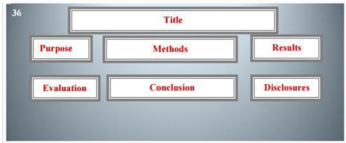
Figure 2 Sample research poster layout, taken from ASHP Poster Presenter Handbook, created for ASHP Midyear Clinical Meeting 2015.