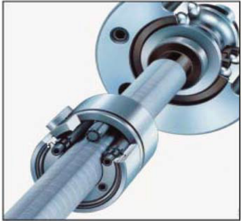
Roller Screw vs. Ballscrew Stiffness - example based on comparable sizes

Planetary roller screws are also replacing hydraulic cylinders on many large machines such as presses, broaches, extruders and similar specialty equipment. They are very quiet, clean, and environmentally friendly by comparison. They also allow for transportability