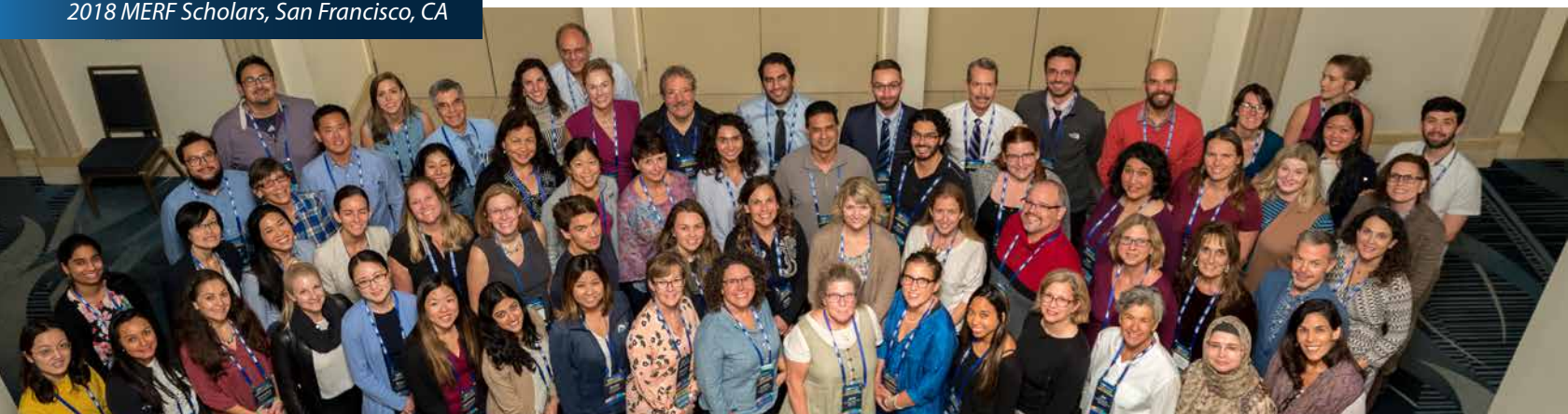
2018 MERF Scholars, San Francisco, CA

Those involved in medical education or practice-based clinical research are invited to submit abstracts for posters to be presented at the conference. (These may be posters presented at other conferences.) The deadline to submit abstracts for poster proposals is July 2, 2019 . For more information on submissions, see http://merfweb.org or contact merfadmin@gmail.com .