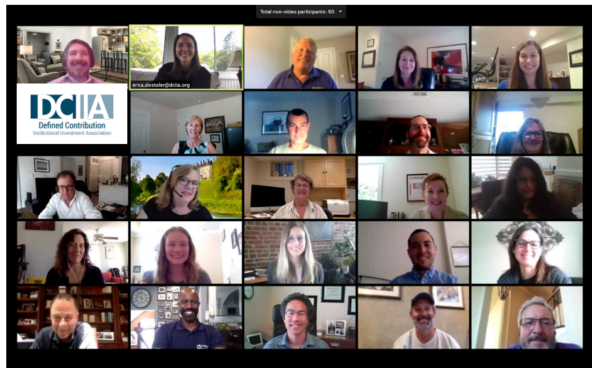
DCIIA members attending our June 2020 Washington, DC Virtual Communities event

Our Virtual Communities bring our members together for networking and educational discussions. Sessions have been hosted by our Regional Ambassadors as well as our Diversity & Inclusion Committee. We're also hosting sponsored networking events throughout the summer and fall.