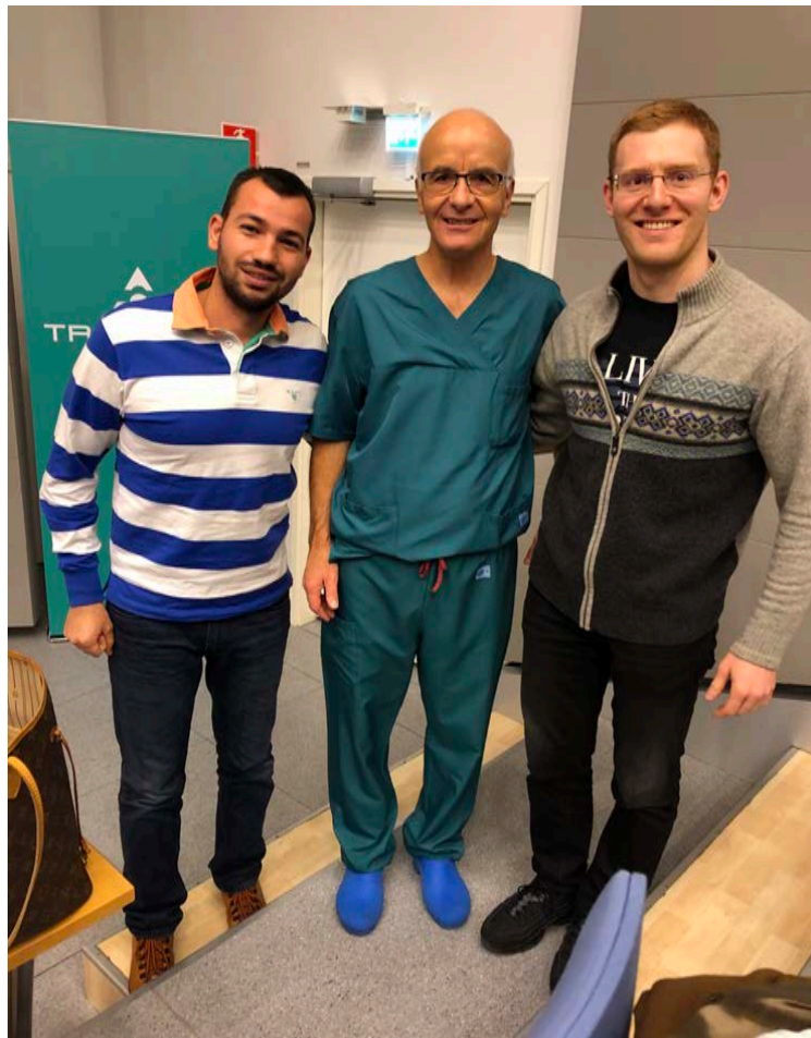
We have made our report about Travelling Fellowship 2019 at the EFAS Advanced Symposia in Helsinki, FINLAND.