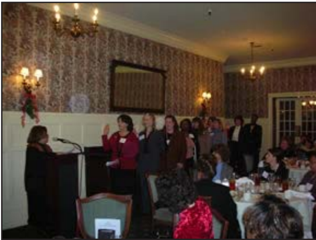
Holiday Lunch swearing-in ceremony