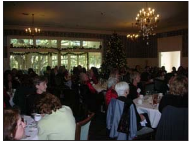
Holiday Lunch audience