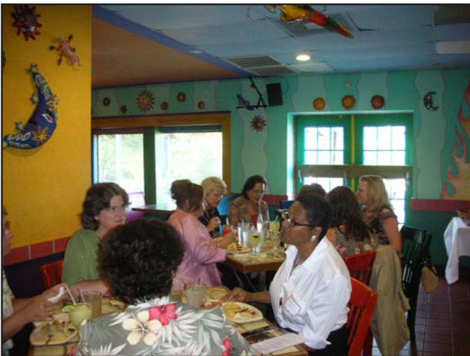
Members enjoying the appetizer buffet at El Mercado.