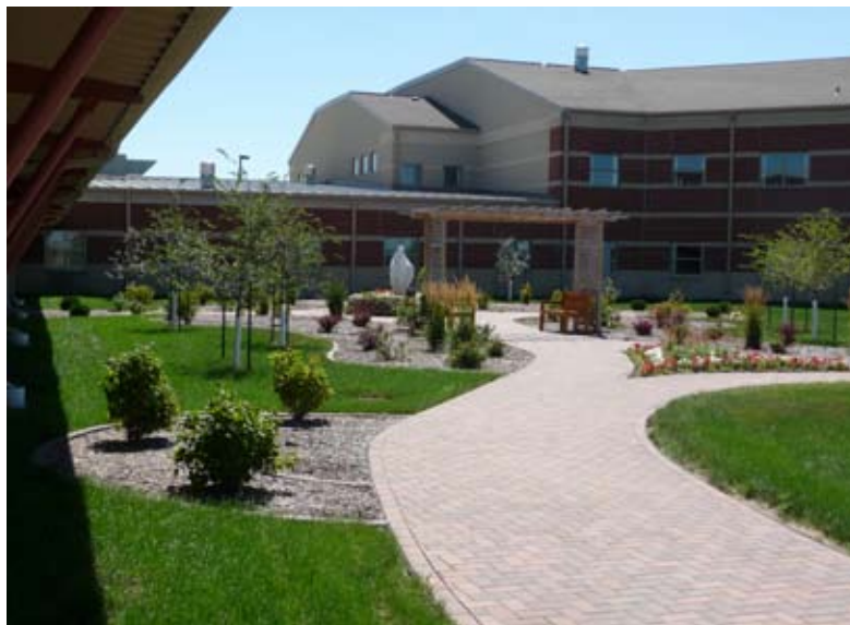
Shanley and Sullivan Mary Garden today

The drain system and storm sewer ground inlets were heavily tested in the fall of 2006 and the extensive snowmelt of the spring of 2007. The system performed beautifully and the building was protected with the Garden site now draining. The phased install was back on track although funds were diminished due to some costs associated