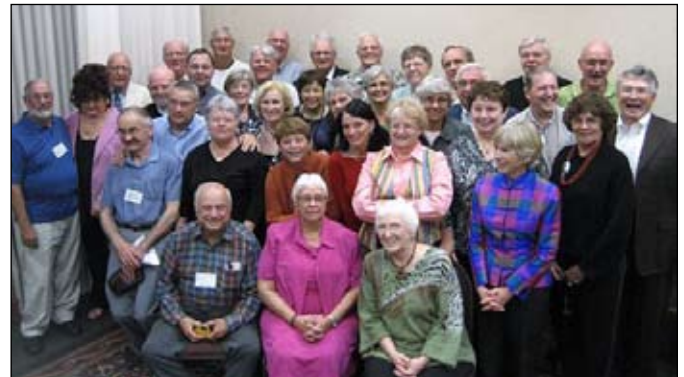
Class of 1969