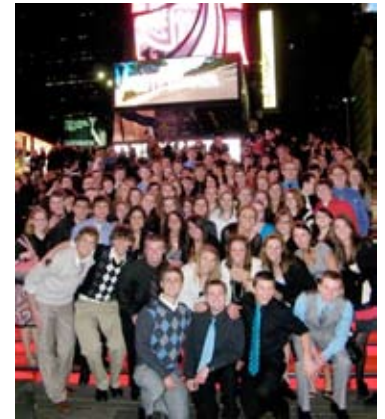
Shanley Students in Times Square

-saw "George Washington's pew" that he occupied the two years the United States Capitol resided in New York City