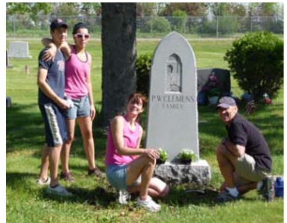
Network students and parents helped to plant flowers and care for the gravesites over Memorial Day weekend.

Over 30 gravesites received this or subsequent service. Members of our Deacon Family were notified of this service through email as registered members of the alumni website. Those who have expressed interest in the service are contacted each spring prior to Memorial Day.