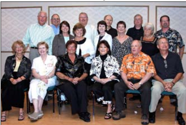
Class of 1979