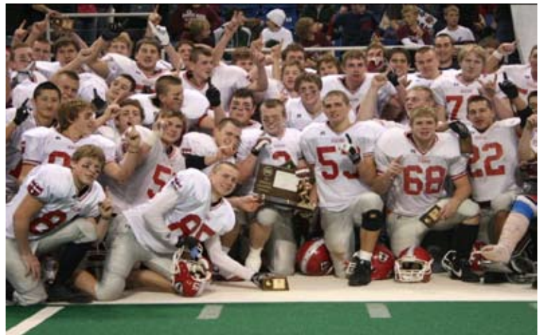
The Deacons were the State Champions