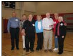
Class of 1979