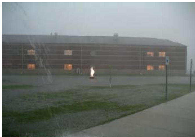
The future site of the Shanley and Sullivan Mary Garden

The primary entrance for visitors, parents and students to Shanley and Sullivan is on the north side of the building entering the Activities Center. This entry truly emphasizes our Catholic faith and mission with the beautiful Mary Garden visible from the parking lot and hallway windows. It is being used extensively for reflective prayer, outdoor