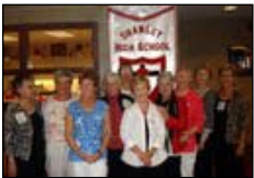
Class of 1954