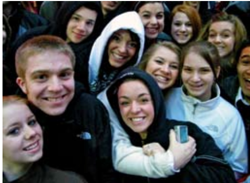
Shanley Students appeared on the TODAY show

-saw the only surviving manuscript of Voltaire's Candide