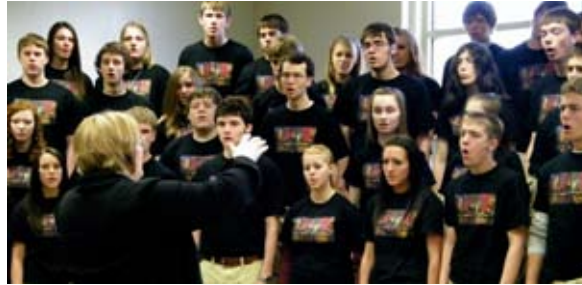
Shanley Students perform at Seton Hall

-Seeing our students take in the Ground Zero experience was very moving. They sang and played so beautifully to an appreciative audience in St. Paul's Chapel, which is directly across the street from Ground Zero. Then Sandpebbles and Quintessence