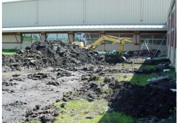
The beginning stages