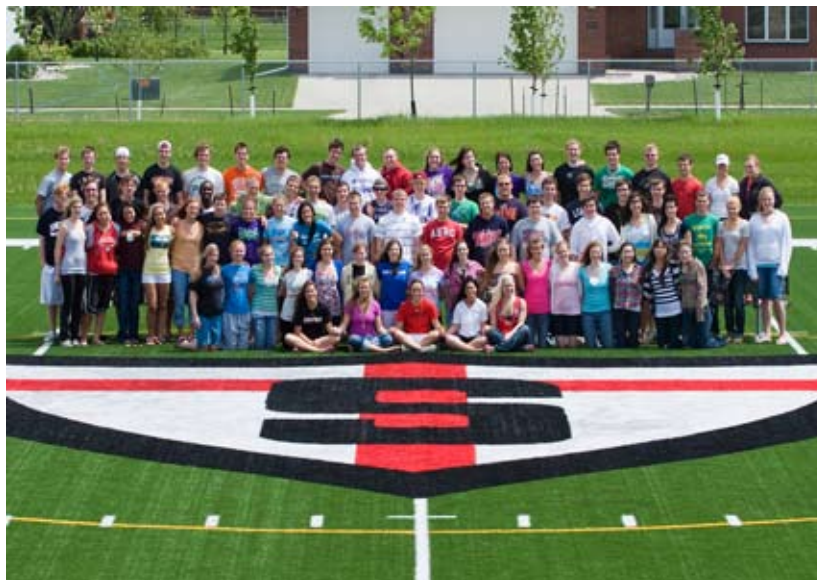
The Class of 2010 Moves On...