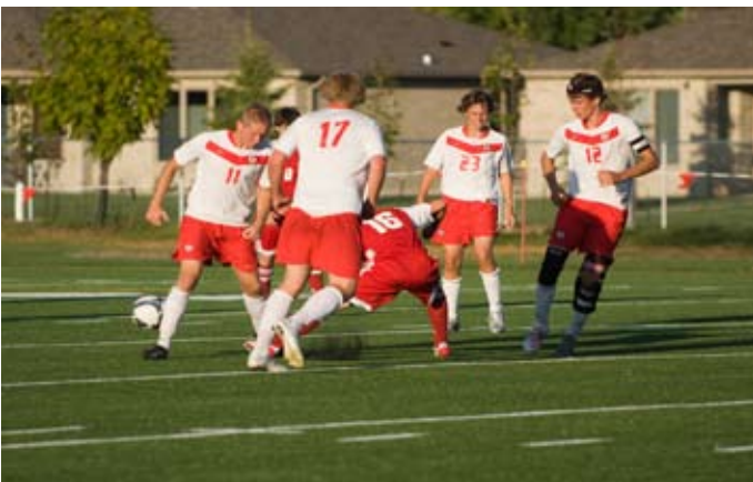
Deacon Boys Soccer

The defending state champion football team and boys and girls soccer teams are really looking forward to their upcoming seasons. The Fargo Catholic Schools Network recently received the largest financial gift in the history of our schools. The $2,000,000 gift from an anonymous donor will enable us to proceed with Phase 2 Construction of our Legends and Legacies Capital Campaign – Sid Cichy Stadium Completion. This includes stands for 1500 people, entry gate, walking paths, press box and the necessary fencing and landscaping. Barring any weather or material complications, we expect the Stadium to be ready for Homecoming against Valley City on