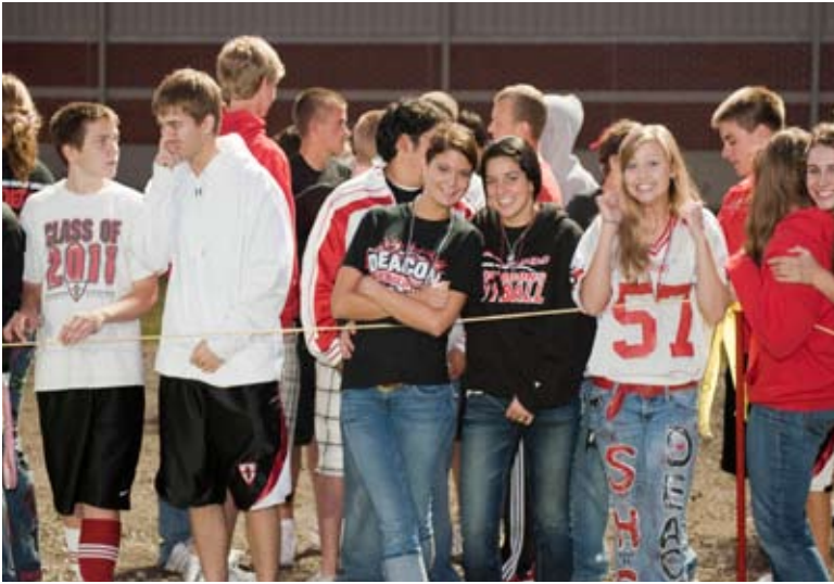
Deacon fans at the Shanley Homecoming