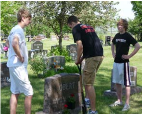
Shanley Students help to plant flowers at the grave sites