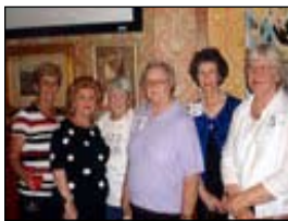
Class of 1964