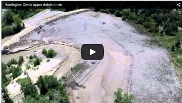
Huntington Creek upper debris basin

This shows pre-event conditions of the basin as well as video during a storm event in July 2014 and the results of the event.