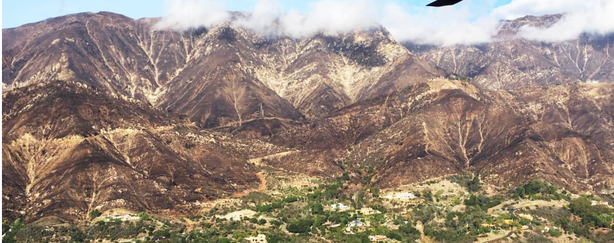
Figure 1. Scarred hillsides from recent wildfire