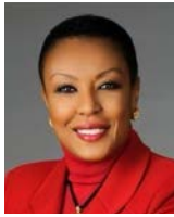
Leah Ward Sears Emory University