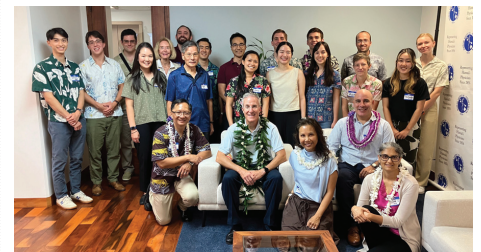
HRS Interisland Annual Meeting attendees