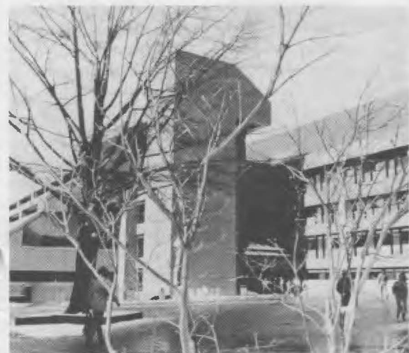
The Georgetown University Intercultural Center, where the conference on scientific literacy recently met.