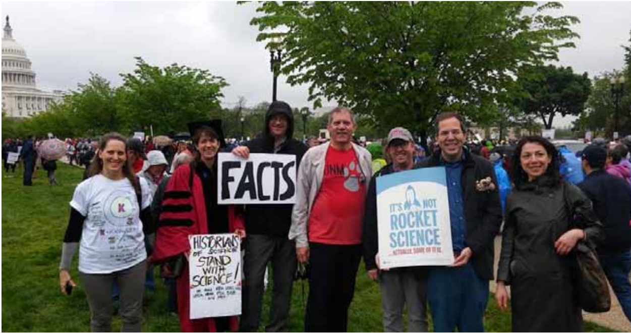
HSS members and friends soggy but cheerful at the end of the Washington March