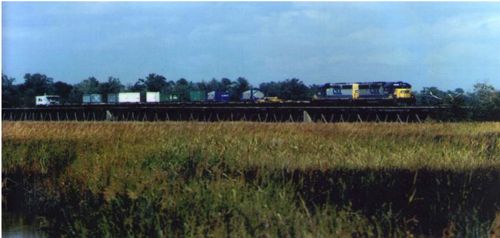
Eight casks from Europe arrive in 1994 as emergency relief shipment