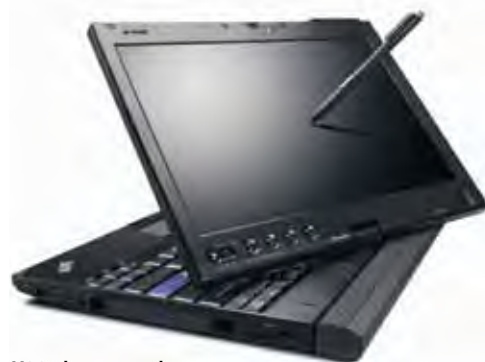
Lightweight magnesium alloy optimizes the Lenovo X201 laptop and X201 tablet's toughness and portability for today's mobile workforce.

Lenovo engineers have chosen magnesium to house their cutting-edge technology. Magnesium covers make the Lenovo X201 and X201 tablet extremely durable yet lightweight with a small footprint, and are designed to pass eight military specifications tests: physical shock, thermal shock, altitude, dust, vibration, humidity, heat, and cold. Professionals in many fields use the X201 to enhance mobility, boost productivity and reduce overall ownership costs. The energy-efficient X201 tablet notebook is ultra-portable, featuring extra-long battery life of up to eight hours, weighing 3.57 pounds with a four-cell battery, and 3.95 pounds with an eight-cell battery. The optional multi-touch panel allows two-finger gestures to pan, zoom, rotate, right-click, and jot down and digitize handwritten notes, in addition to standard touch-screen features.