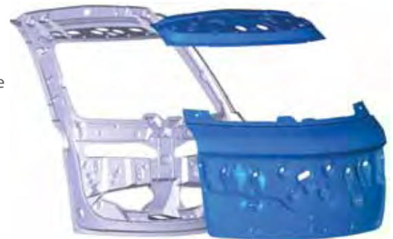
The cast magnesium inner panel, shown in light gray, varies in thickness from 2mm at the thinnest spot, to 7mm at its thickest area. The aluminum outer panel is shown in blue.

The MKT engineers stress that although magnesium raw material cost is more than steel, an all-steel liftgate would be much more complicated and expensive to manufacture than the magnesium/aluminum liftgate, and too heavy for power lift systems to open. Magnesium not only accomplishes Ford's weight reduction goals, it creates new design options. Ford plans to continue reducing vehicle weight by 250 to 750 pounds to help meet strict fuel economy targets without compromising vehicle safety or durability.