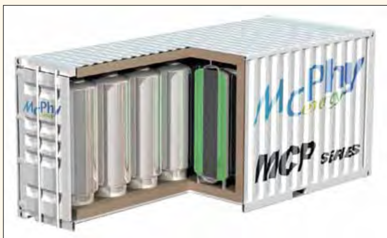
This storage tank uses disks formed using magnesium hydrides to store solid hydrogen energy for later use.

Magnesium's role in this hydrogen storage breakthrough has been critical. McPhy Energy board member Michel Jehan explains how the magnesium is processed: "From magnesium powders, we produce MgH_2 in about a 100 micron size. Then we grind the powder with special transition metal additives within highly reactive ball grinders down to less than one micron in size, under a reactive blend of gas containing H_2 . We transfer the reactive powders and blend them with carbon material, then press the material into large disks. The disks become the storage material for the hydrogen, and are packed into pipes that resist up to 15 bars of pressure within the storage tanks."