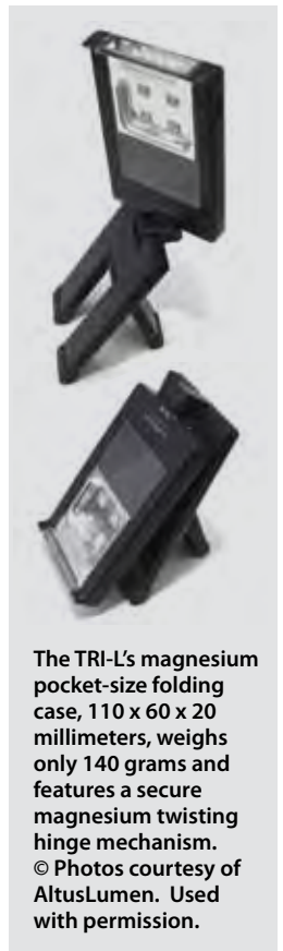
The TRI-L's magnesium pocket-size folding case, 110 x 60 x 20 millimeters, weighs only 140 grams and features a secure magnesium twisting hinge mechanism.

The pocket-size portable light follows the company's guiding sustainability principles that include energy efficiency, using renewable energy, and choosing materials that are recycled and recyclable. AltusLumen engineer and TRI-L project manager Samuel Ng confirms the recycling benefits of AZ91D. Says Ng, "Magnesium is one of the few materials that can be endlessly recycled without degradation. Magnesium is easier to recycle and its value makes it an attractive material to recycle."