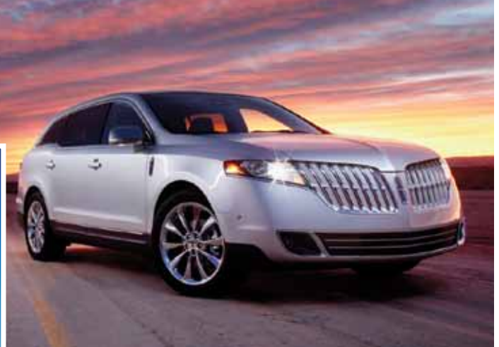
The Lincoln MKT liftgate design uses magnesium and aluminum panels to create a liftgate that is 40 percent lighter than a standard steel liftgate.