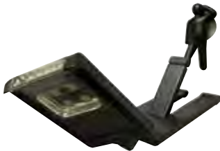
The magnesium swivel hinge and foldable tripod stand make the TRI-L LED portable light a hands free, go anywhere device.

Sustainable function and contemporary design combine in the ingenious LED portable light made by AltusLumen, Hong Kong, China. The light's entire housing is constructed of magnesium alloy AZ91D. AltusLumen's TRI-L portable LED is a convenient rechargeable lithium-ion battery light with intelligent power management, featuring a three-dimensional hinge that adjusts to any lighting angle. The ultra-bright and efficient LED light runs for several hours on a single charge, and may be charged by solar panel with an optional solar charger.