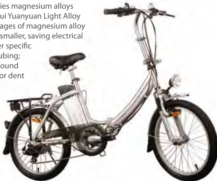
This electric bicycle achieves extended battery life and runs longer on a single battery charge due to the ultra-lightness of magnesium.

The bike's magnesium alloy main frame and luggage carrier components are welded together, and then attached to other bike components with screws. Since lightweight magnesium alloy substantially reduces the bike's weight, its battery unit powers far less weight, thus extending the battery's useful life. Choosing magnesium alloy also supports Hengshui Yuanyuan Light Alloy's environmental goals because it is 100 percent recyclable, and uses less energy during the recycling process than other metals.