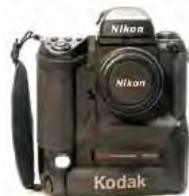
A complex magnesium die cast case houses Nikon F-5 optics in a tough, yet lightweight design in the Kodak® Professional DCS 620 digital camera. © Photo courtesy of Chicago White Metal Casting, Inc. Used with permission.

Hot-chamber magnesium die-cast parts used in Kodak's DCS camera case feature built-in EMI shielding. © Photo courtesy of Chicago White Metal Casting, Inc. Used with permission.