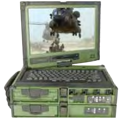
Magnesium meets and exceeds the most challenging conditions to form one of the most powerful, portable and configurable computing systems available for tactical operations.

Magnesium's advantages include high strength, stiffness, durability, and superior impact resistance, making the laptop parts 20 times stronger than typical thermoplastics. The rugged core computer and dock benefit from lightweight magnesium alloy, which may be molded into ultra thin-walled parts, down to 0.020 inches. The precision laptop design weighs just 7.9 pounds and measures 11 inches wide by 8.5 inches deep by 2.4 inches high. The 15 magnesium injection molded parts in the MSD-V3 include: power input mount housing; manifold cover; docking station battery door; RAM access, CMOS, PCMCIA, DVD, computer battery and hard drive doors; bezel for display screen frame and cover for back of display screen; the computer chassis and cover; and the docking station chassis and cover.