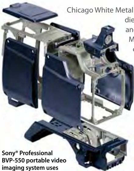
Sony® Professional BVP-550 portable video imaging system uses magnesium die castings to achieve high-strength, low weight, EMI/RFI shielding in its exterior enclosure.

Sony Corporation, Tokyo, Japan, made the casting call for the perfect parts in their Sony® BVP-series professional video camera – magnesium and aluminum co-star as die-cast precision components for the out-of-studio camera's base, chassis, outer panels and internal sub-assemblies. Sony engineers required lightweight, high-strength components to protect the advanced CCD image sensors, digital video processing and digital control systems inside.