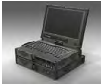
Fifteen magnesium injection molded parts comprise one of the toughest, most compact laptops available that meet strict military specifications in the field of operations.

The magnesium alloy housings and enclosures provide effective EMI shielding without using fillers, with an applied conversion coating. Magnesium's EMI shielding ability is critical during military field operations, since the magnesium parts protect the laptop from radiated and conducted emissions, electromagnetic pulses and radiation hazards. In addition, magnesium used in the MSD-V3 meets military specifications for withstanding extreme temperatures, solar radiation, shock, transportation vibration, altitude, rain, humidity, sand, dust, and salt fog.