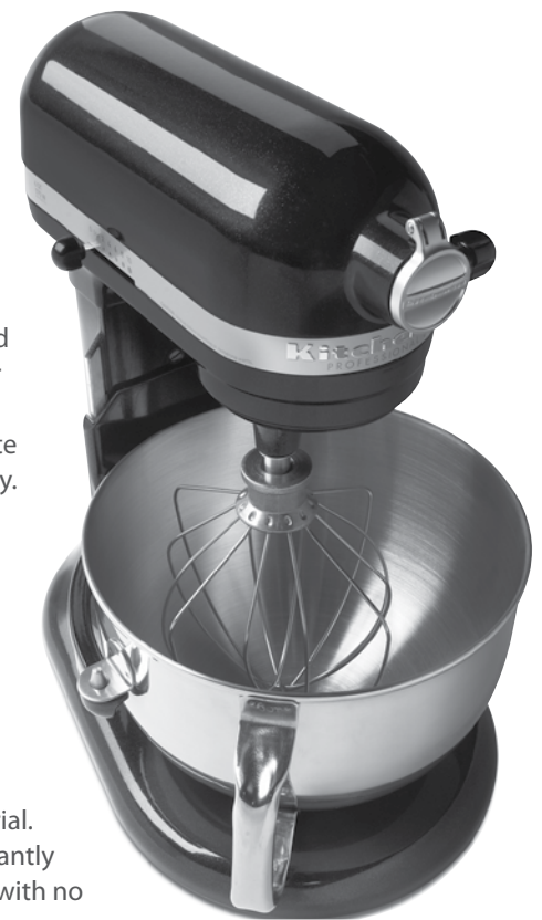
A magnesium transmission housing helps the KitchenAid® Professional 600™ 6-quart stand mixer achieve commercial-grade high performance.

The magnesium transmission housing has proven to be a cost-efficient and key part that keeps this powerful mixer dishing out great food. KitchenAid states: "To our customers, a magnesium metal housing offers peace of mind, in contrast to what they perceive a plastic part to be."