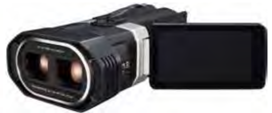
Weighing just 1.4 pounds (590 grams) with the battery, this JVC magnesium frame video camera uses two lenses and two 3.32 mega pixel CMOS sensors to capture full HD 3D video by processing left and right images simultaneously using a high-speed imaging engine.

The JVC camcorder with twin HD lenses allows glasses-free 3D video that lets the user preview in 3D as recording takes place. The magnesium frame enclosure houses a host of high-tech electronics, and includes features such as a backlit 3D button enabling easy switching from 2D to 3D mode, 5 times optical zoom, the ability to access the battery port and SD card slot while mounted on a tripod, and sports a mottled finish for an easier grip and high-end look.