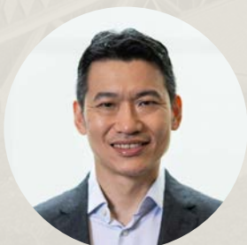
Mr David Neo Acting Minister for Culture, Community and Youth & Senior Minister of State for Education

Wishing all a meaningful Congress, and great experiences that bring all of us closer together as a global community.