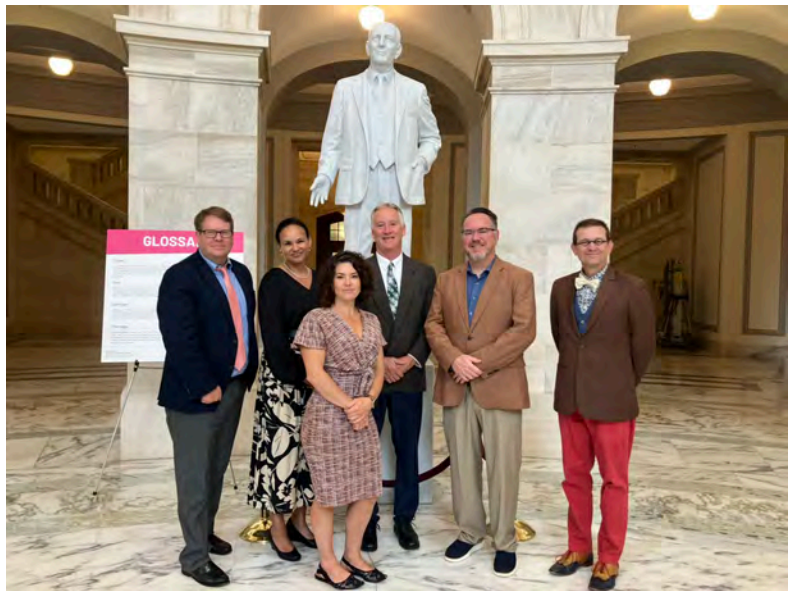
IWPA Staff & Members at the 2025 Fly-In