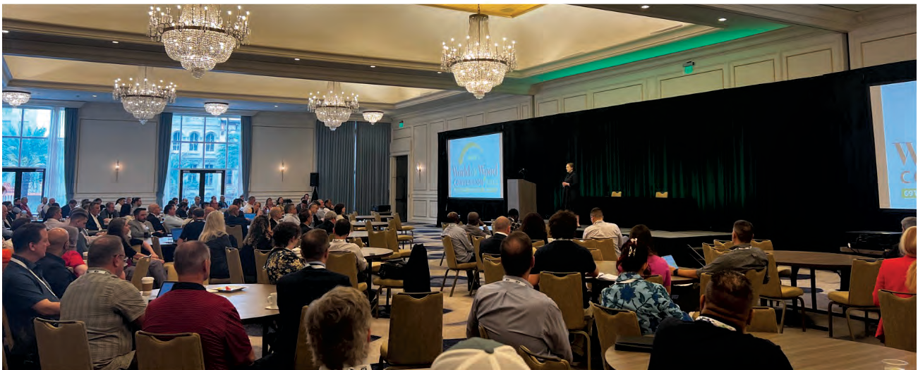
IWPA 2025 World of Wood Opening Meeting