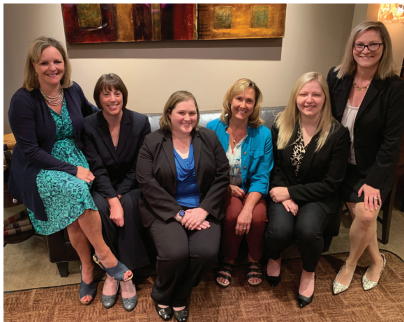
The MWL members at LeVander, Gillen & Miller

In the years that followed, this small, unassuming firm earned a distinctive reputation for leadership and commitment to public service by producing two Minnesota governors, a United States Senator, a United States Congressman, two Minnesota Supreme