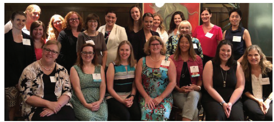
MWL Solo & Small Firm Affinity Group pictured at their 2019 Summer Social

Find the full report online at: www.mwlawyers.org