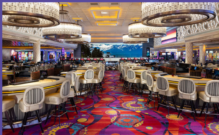
Enjoy an evening of gaming at the on-site casino!