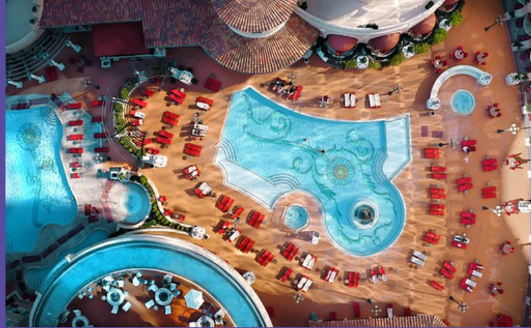
Upper Deck Pool

Don't want to leave the property? No problem! Enjoy some of the Peppermill Resort activities!