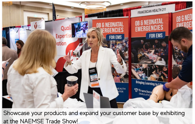
Showcase your products and expand your customer base by exhibiting at the NAEMSE Trade Show!

Dedicated sponsor posts are integrated into Guidebook's built-in social media feed, INTERACT. This is a great way to increase visibility and ROI. Hyperlinks and/or photos can be utilized to maximize clicks.