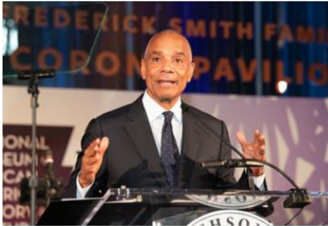
Photo of Kenneth Chenault, former CEO of American Express, who organized other business leaders to speak out about voting rights.