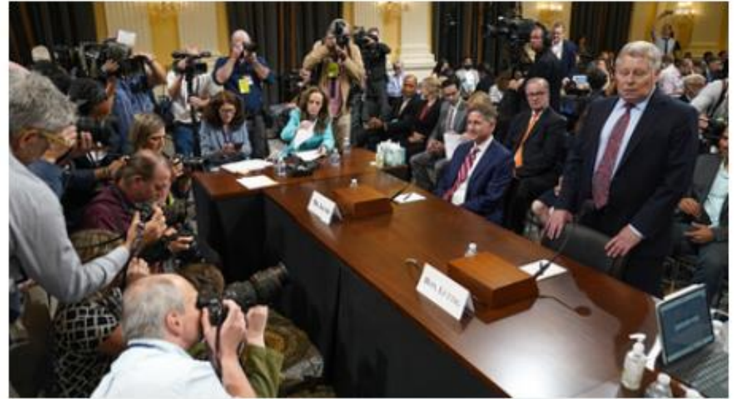
J. Michael Luttig, a former federal appeals judge, warned about the dangers to democracy created by those sowing distrust in June, 2022 before the U.S. House Select Committee on Investigation of the January 6 Attack on the U.S. Capitol.

"Every day for years now we have borne witness to vicious partisan attacks on the bulwarks of that democracy – our institutions of government and governance and the institutions and instrumentalities of our democracy – by our own political leaders and fellow citizens. Every day for years now we have witnessed vicious partisan attacks on our Institutions of Law themselves, our Nation's Judiciary, and our Constitution and the Laws of the United States – the guardians of that democracy and of our freedom. For years, we have been told by the very people we trust, and entrust, to preserve and to protect our American institutions of democracy and law that these institutions are no longer to be trusted, no longer to be believed in, no longer deserving of cherish and protection." 36