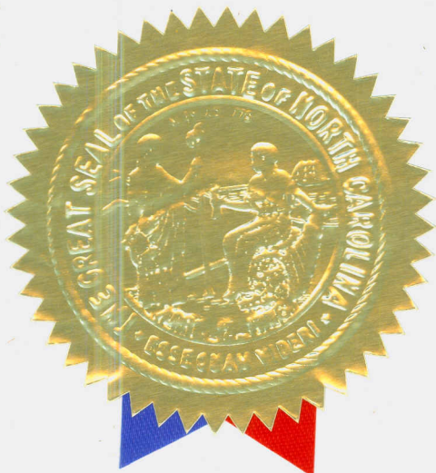
BEVERLY EAVES PERDUE

NOW, THEREFORE, I, BEVERLY EAVES PERDUE, Governor of the State of North Carolina, do hereby proclaim June 2011, as " NORTH CAROLINA COMMUNITY GARDEN MONTH ," and June 7, 2011, as " NOURISHING NORTH CAROLINA DAY " in North Carolina, and commend its observance to all citizens. I further encourage citizens to explore ways to include community gardens in their own neighborhoods as a start to living a more healthy life.