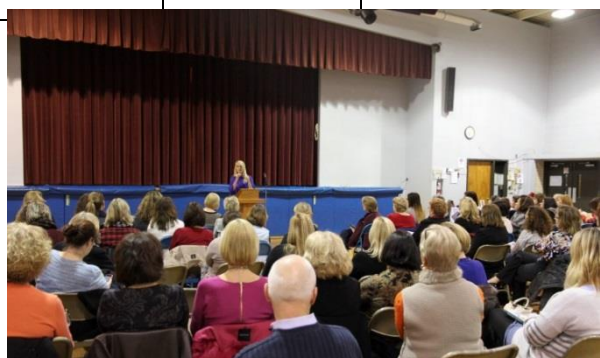
Elin Hilderbrand appearing at Grey Nun

For in-store events, we can seat as many as 40 people with standing room of 60+.