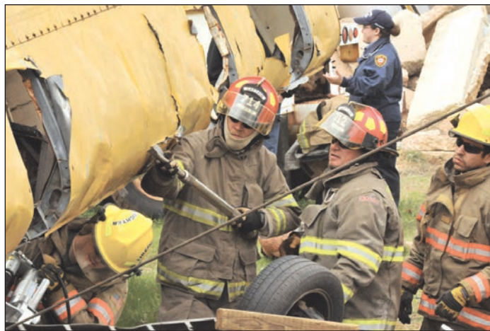
Firemen from all over the state work together to improve advanced vehicle extraction skills. Firemen cut open a school bus with hydraulic tools to extract patients in a school bus wreck simulation.