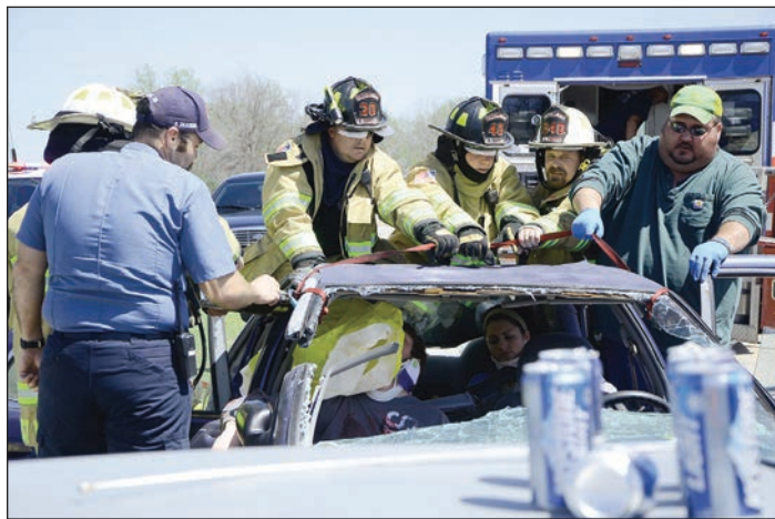
Ringling volunteer firemen show how they work to free individuals trapped in a car using the Hurst Tool to cut the car to allow the roof to be pulled back. The mock accident depicted a drunk driver in one car, a car load of kids in second car and one student who was ejected and 'died at the scene.'

Photo by KYLE PHILLIPS, The Norman Transcript, May 21, 2013