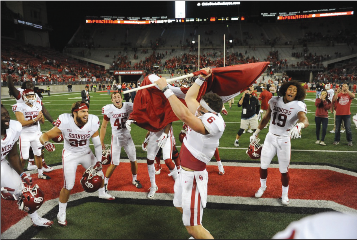
OU quarterback Baker Mayfield plants an OU flag on the 50-yardline after the Sooners' win over Ohio State, on Sept. 9, 2017.