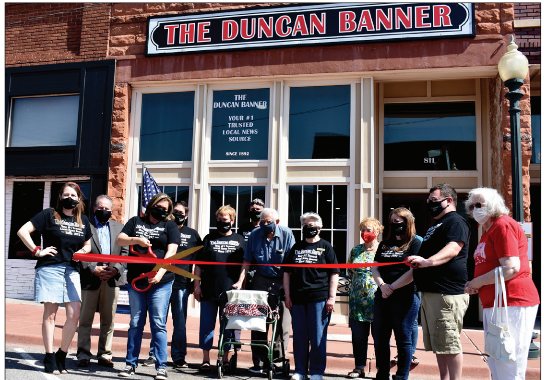
The Duncan Banner staff celebrates moving to Main Street with a ribbon cutting. The event included a virtual tour, open house, refreshments and door prizes.

“The Banner staff is proud of its return to Main Street Duncan. After 128 years in business, we can say we are looking forward to serving our community for another hundred years to come,” an article from The Banner said.