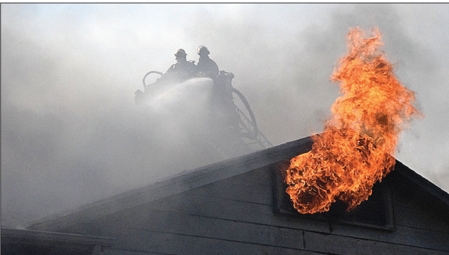
Pushing through the smoke and spraying water with force, Lawton firefighters in the bucket of a ladder truck work to contain a fire as it erupts out from the attic area of one of the buildings at Landings III.

Photo by JEREMY ROBBINS, The Chronicle , July 9, 2020