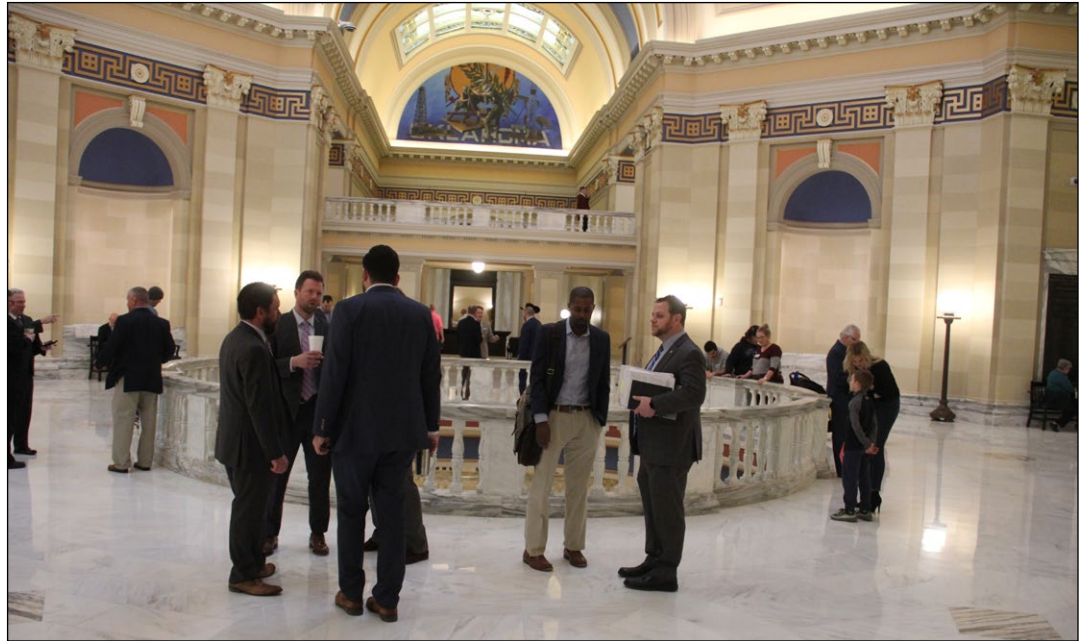
The rotunda at the Oklahoma State Capitol is a hub where legislators and visitors can relax and enjoy the historical building.

Visiting legislators at their Capitol offices makes an impact. Legislators listen to peo-