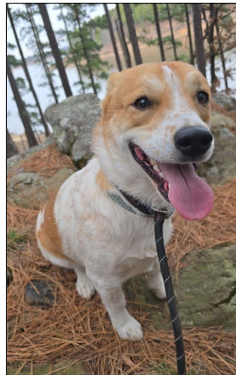
Mouse, the Atoka County Times' mascot dog, rests on the rocks overlooking McGee Lake during the First Day Hike on January 1.

Once the group hit the halfway point, the trail smoothed