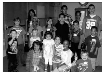
Kids enjoyed the conference too!

Our thanks, too, to the many volunteers who helped make this program successful.