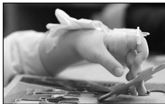
With permission of Albany Medical Center