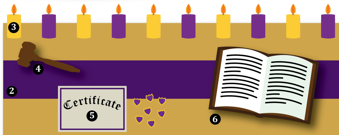
Table View from ABOVE

3 Candles: Use 5 purple and 5 gold candles on your table. Purple candles can be difficult to find in-store, so consider looking online first. Purple candles may also be more easily available around various holidays throughout the year. Be sure to check with your venue's/campus' rules about lighting flames in the room; electric candles are a safe, easy alternative.