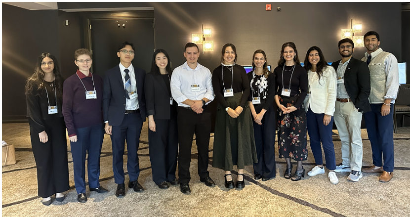
Medical students at the meeting