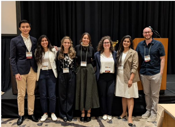
MSS and RFS leadership

The Pennsylvania Radiological Society held its annual meeting on September 12th-13th, 2025, bringing together medical students, residents, and fellows from across the state. The first day centered on career development with sessions on contract negotiations and the landscape of private equity versus academic practice. The second day featured a wide range of presentations, including the role of artificial intelligence in radiology, lessons from radiologists practicing in Cuba, leadership and work-life balance, a resident-fellow panel, and strategies for policy engagement. In addition, 35 research projects were accepted for presentation, with awards distributed during the dinner reception.