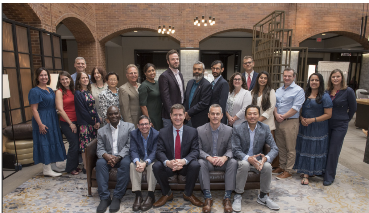
PARAD Board in Philadelphia , PA

The board of the Pennsylvania Radiological Society met on Friday, September 12 th , in Philadelphia, PA. A broad range of subjects were addressed, with special attention to budget and meeting planning. PARAD is not immune to the post-pandemic challenges of inflation and engagement. The Society conducted one board meeting in hybrid format in spring 2025 for cost control, with a good outcome and will continue to implement ways of budget improvement. Still, finances remain strong particularly considering the current climate. In 2021, the PARAD Legacy Fund was established to promote the education of its' members and other radiology interests. It continues to thrive and we encourage your continued support of the Fund.