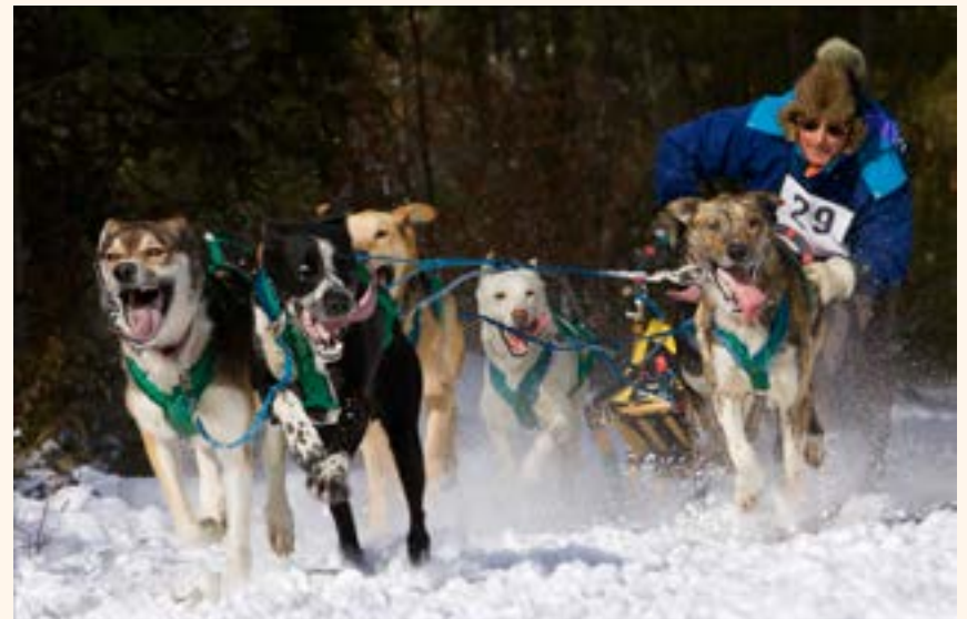
Husky Racer 29.

For individuals the Division conducts creative and portrait competitions, a photo essay competition, as well as the Image of the Year competition. Two digital-only Interclub competitions are held four times each year—one open to all