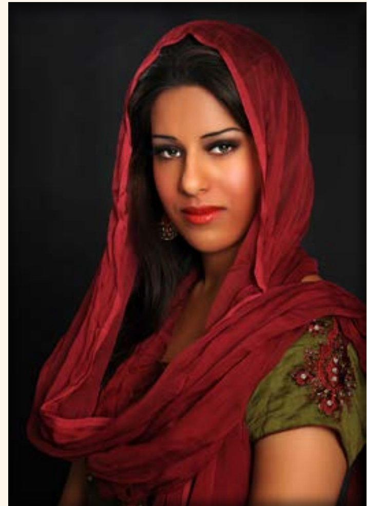
My Favorite Outfit

There are no limitations on subject matter or techniques used for image capture or post processing within print international exhibitions or division activities. PPD has four star tracks (sections) within international exhibitions: large and small open prints, and large and small monochrome prints. In PPD study groups of 8-10 people are called Portfolios . There are general Portfolios and Portrait Portfolios in North America. The Pictorial Print of the Month competition is a popular activity which originated as a Society activity but is now managed by the Division. The winning print appears in the monthly PSA Journal . PPD runs interclub competitions four times a year, and the division provides judging services for clubs as requested.