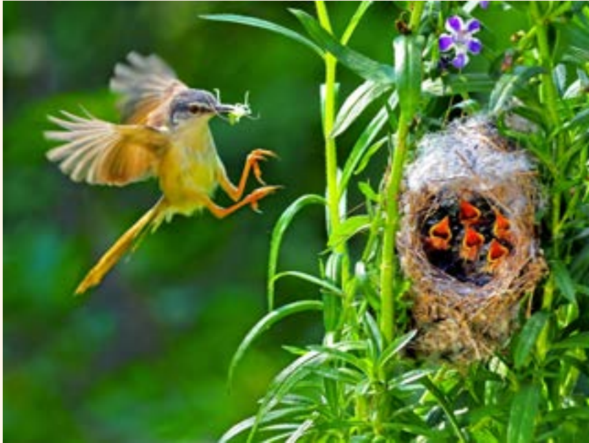
Feeding Tawny-flanked Prinias

The Nature Division (ND) was established in 1940, and by 1952 there were numerous nature study groups for wildflowers, birds, insects and other natural subjects. The Division has long provided identification services to help with technical names of subjects as well as personal evaluation services for all PSA members. The Division recognizes over 170 international exhibitions. The concept of presenting the Nature Story in photography has become increasingly important through the years.