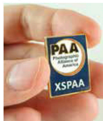
XSPAA Honors pin

– Awarded to a PAA member for Exemplary Service and Leadership to advance PAA nationally and internationally, provide international visibility for USA photography, and mentor PAA members to achieve FIAP Distinctions and provide leadership for PAA. The Exemplary Service Honor is awarded by earning 150 points, including at least 10 leadership points.