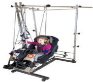
Quadricizer Therapy System