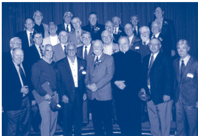
50th Anniversary Class of 1954