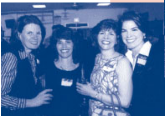
1979 classmates at the reunion