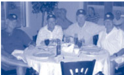
The tournament winners wearing their St. Francis regalia.