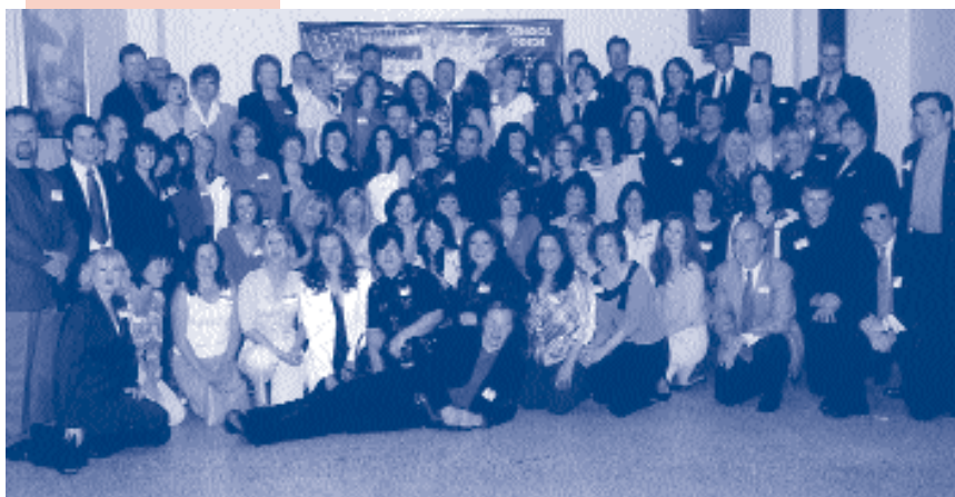
25th Anniversary Class of 1979