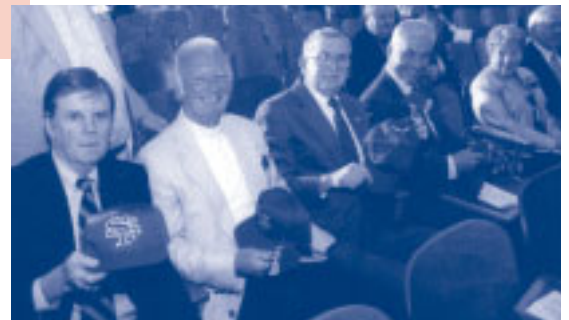
50 year honorees show off their caps