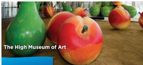
The High Museum of Art

For complete details, see the Conference section on our website at www.naccchildlaw.org .