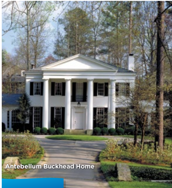
Antebellum Buckhead Home