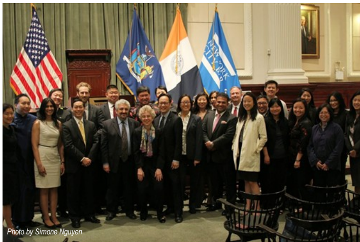
The cast of "22 Lewd Chinese Women," AABANY leadership, and New York City Bar leadership celebrate a successful reenactment with a group photo.