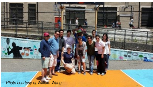
Dynasty Project and Apex for Youth's Playground One Restoration Project drew together many AABANY, AALFNY, and Skadden affinity members for an important community project.

May 31, 2014 A A B A N Y , AALFNY, Taiwanese American Professionals NY and Skadden's Asian Affinity Group volunteered for the Playground One Restoration Project organized jointly