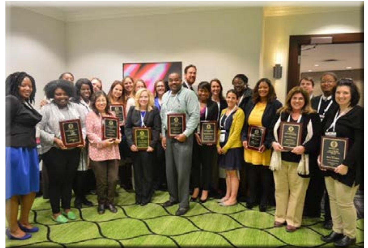
CSI Award recipients at the Awards Ceremony