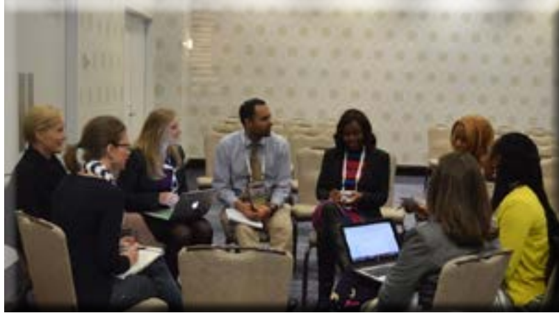
CSI members participate in a small group discussion during the leadership workshop

“ B ienvenue à Montréal! Welcome to Montreal!” was our combined French/English greeting upon arrival in the great Canadian city in the Province of Québec. Indeed, we could be in no better venue for CSI DayS this year as we welcomed new leaders and gathered our membership for some of the most important business of the year. To begin the week, the Executive Council (EC) met and subsequently welcomed the new CSI Leadership Fellows and Interns (LFIs) to observe this final working session of the EC for the fiscal year. The LFI program is a unique opportunity for emerging leaders to develop their skills and competencies to serve within CSI and the counseling profession as a whole. This year’s LFIs are an outstanding group of individuals, and we welcome them all.