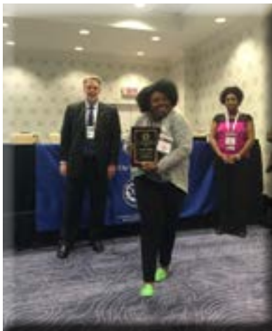
Alpha Zeta Chapter receive their Outstanding Newsletter Award for "The Advocate"