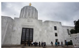
How Laws are Made in Oregon

This new learning environment provides continuing education (CE) opportunities to ONA members and nurses across the region, in a convenient and user-friendly format. The OCEAN system features: