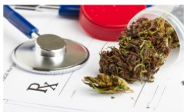
Medical Marijuana for Pain