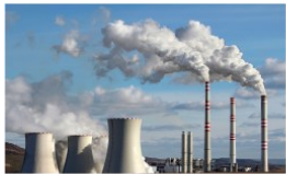
Health Effects of Climate Change