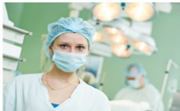
Hospital Nurse Staffing