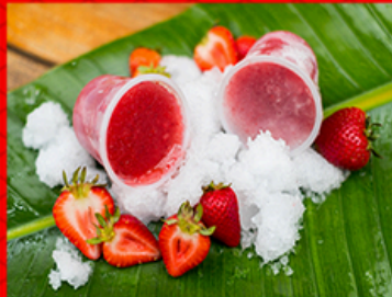
Strawberry Fruit Cup