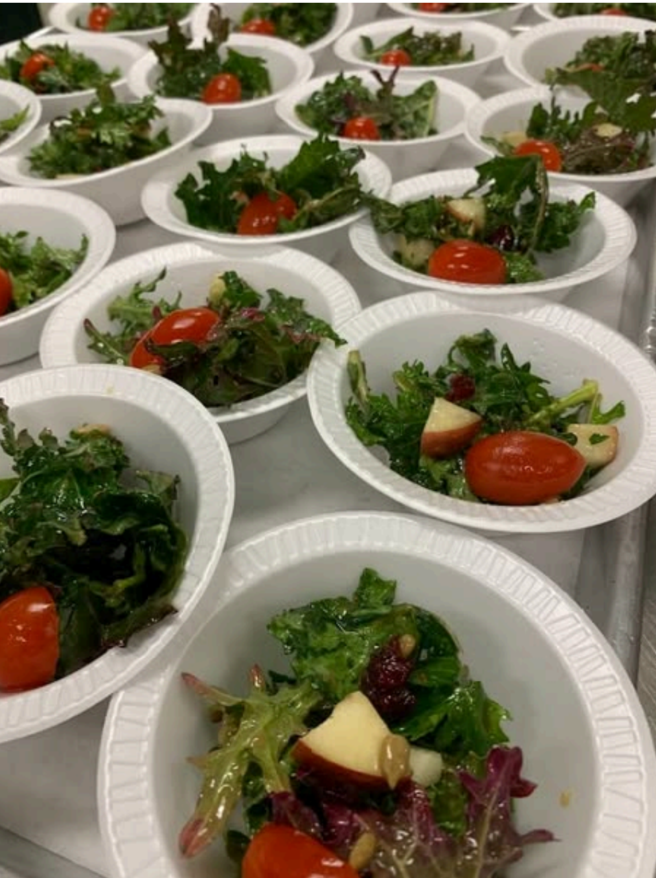
Locally grown Sunset Farm kale served at Watertown School Food Services